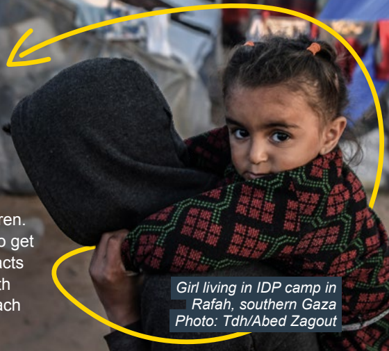
Girl living in IDP camp in Rafah, southern Gaza

In Gaza today, there is no safe place for children. The blockade makes it heartbreakingly hard to get help in, but thanks to you, Plan International acts fast every time a chance appears, working with local partners and using every resource to reach families in crisis.