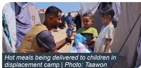
Hot meals being delivered to children in displacement camp

Caring for Children: Psychological First Aid for 157 children; protection support for 200+ caregivers.