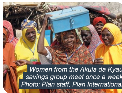
Women from the Akula da Kyau savings group meet once a week

The women seize every opportunity to raise awareness among other families.