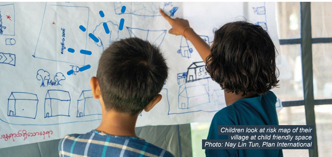
Children look at risk map of their village at child friendly space

The war still brings fear and uncertainty for families like Helga's. But your support helps keep education and hope alive when they are needed most. Thank you for standing with children through it all.