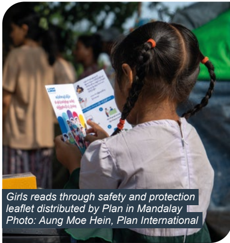
Girls reads through safety and protection leaflet distributed by Plan in Mandalay